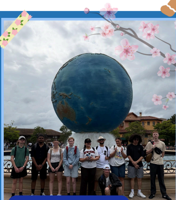
A cloudy day (thankfully!) at Disneyland!