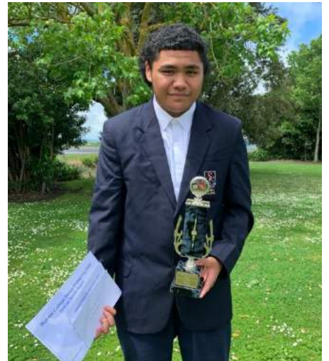
Mikaere Barron Fair Play Trophy for Sportsmanship