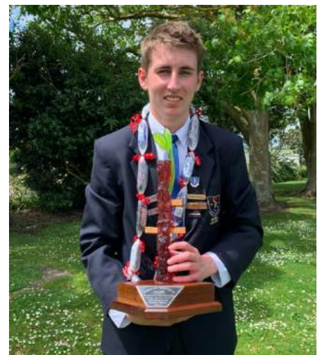
Matthew Blundell History Research Award – The Scott Family Trophy