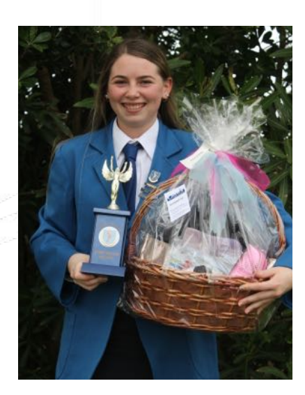
The Endeavour Trophy for a positive and hardworking approach to all aspects of schooling: