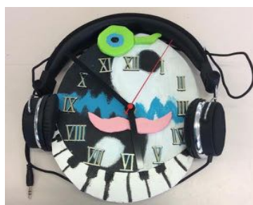
Clock Charlotte Warbrooke Hard Materials